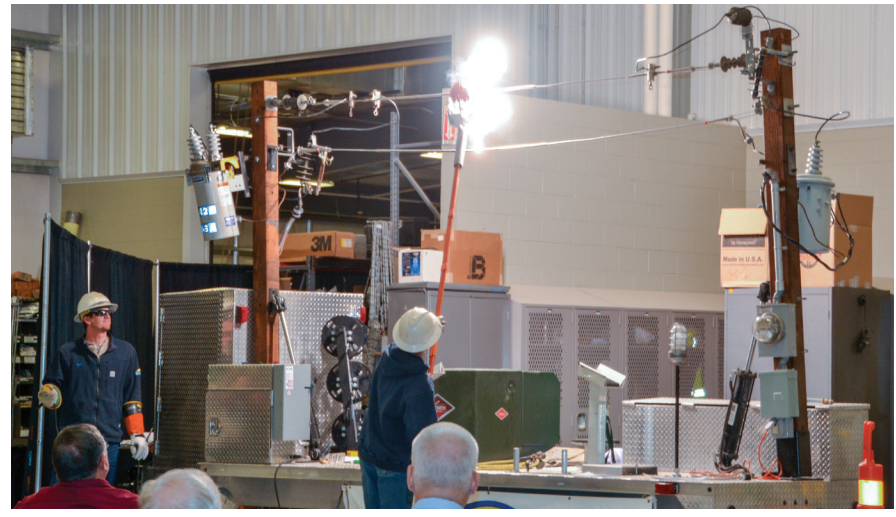
Join us at the 2019 Annual Meeting for the Safety Program.

Load up your family and join us for a delicious meal, short business meeting and door prizes. Each member in attendance will receive a gift upon registration. Mark your calendar to join us on Friday, April 5. We look forward to seeing you.